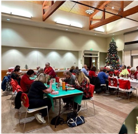
Finishing a our tasty dinner.