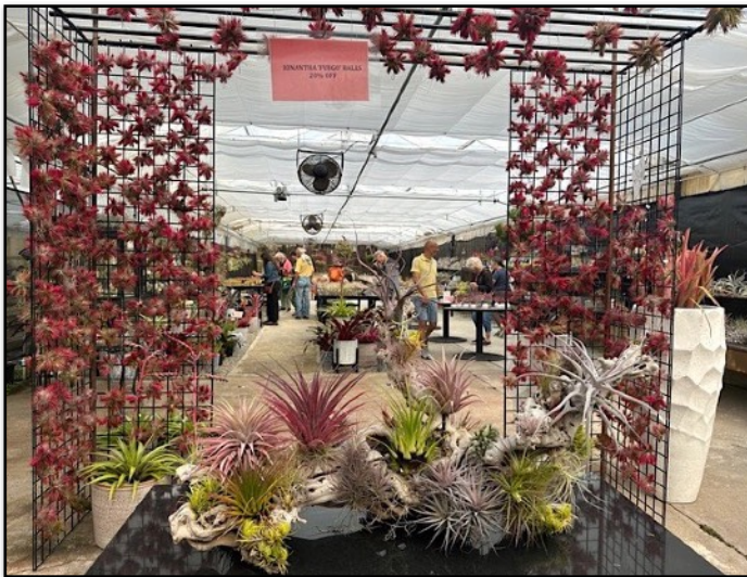
The sales area (above).

Bus tour to Santa Barbara area: On October 14, the Bromeliad Society of La Ballona Valley and the South Bay Bromeliad Associates held their annual joint bus trip to several distant nurseries. Many of our members also belong to these societies and seven of us spent a delightful day searching for new additions to our collections and meeting new Bromeliad friends. Will our society hold a similar bus tour in the future? Maybe!