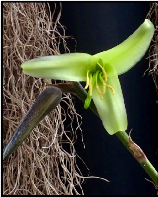
Puya mirabilis .