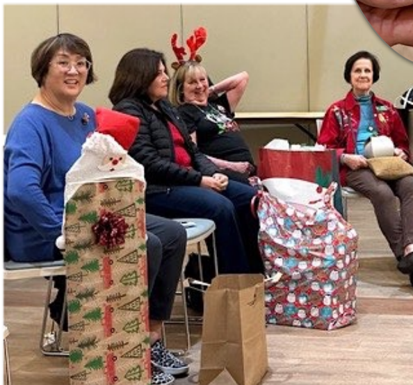
Waiting to see if their gift will be "stolen" in the second round.