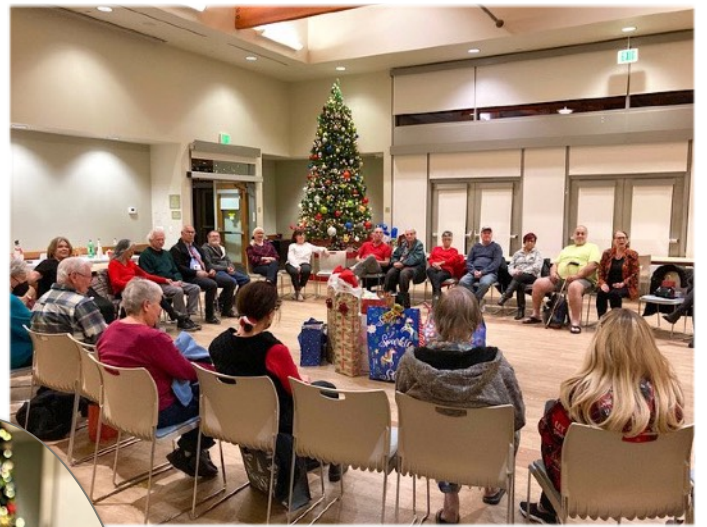
The tables were put away and the eager members formed a circle around the colorful and mysterious presents.