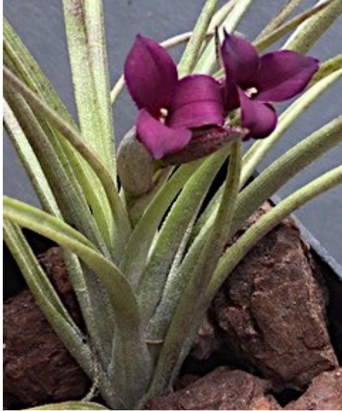
Tillandsia 'Mystic Albert' ( T. albertiana X T. stricta).