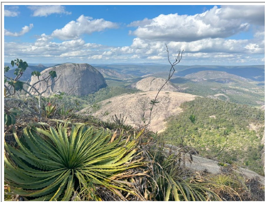
Encholirium horridum, which only grows on granitic domes (inselbergs) in southeastern Brazil.