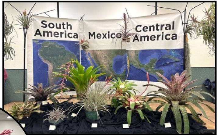
Pam Koide-Hyatt's photo display of Mexican Tillandsias