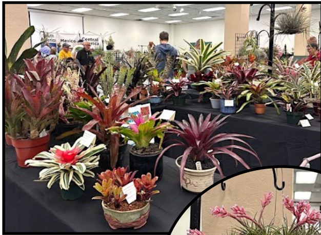
Beautiful Bromeliad displays