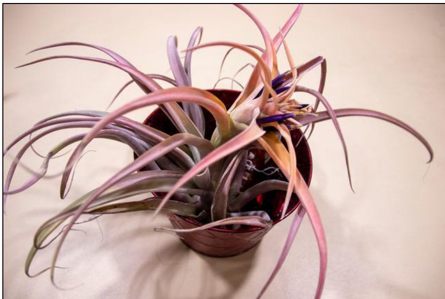
Tillandsia capitata 'Peach' Patti Dunn