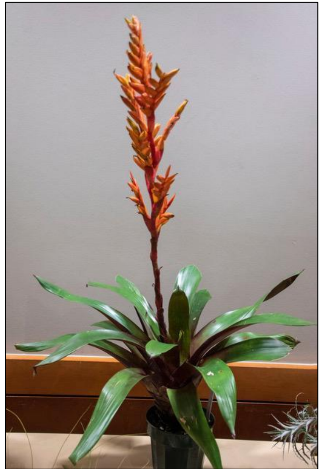
Aechmea fendleri