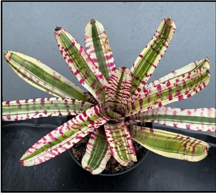
Neoregelia 'Wild rabbit', photo by Ed Voelker.