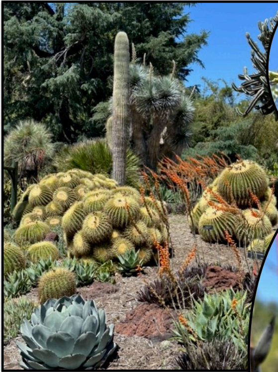
Many orange-flowered Dyckias were in bloom in the cactus garden.

Huntington Gardens Bus Trip: On Thursday, May 8, forty members and friends traveled to San Marino to tour this amazing garden. The group immediately scattered to different areas of this huge and very diverse garden. Some stayed in the upper area to see the conservatory, and the Japanese and Chinese gardens. Others headed down the hill to the desert garden where the Puyas, Dyckias, and other dry-growing bromeliads are located. Below are some of my photos of the desert garden. We also toured the Australian garden, subtropical garden, jungle garden (with many familiar bromeliads) and the palm garden.