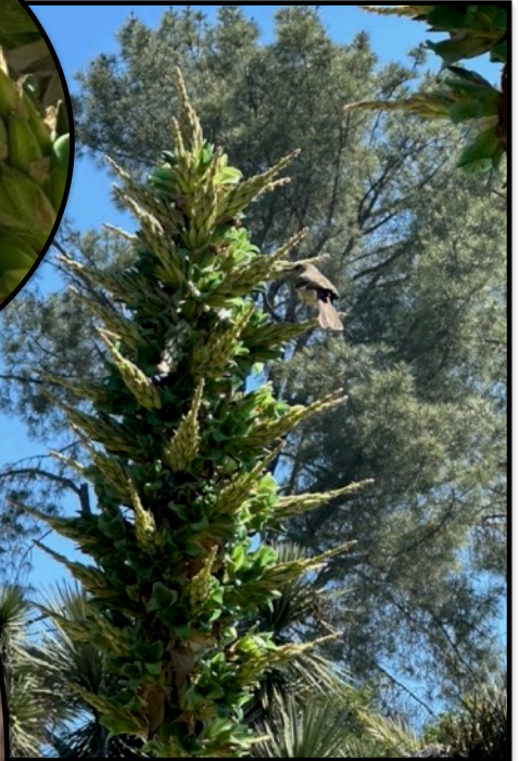
The Puyas were beautiful. The huge green-flowered one above is being visited by a nectar-drinking Mockingbird and another is being pollinated by a Mourning Cloak butterfly and a honey bee. A very unusual Puya (left) had bright pink scapes with totally black flowers!